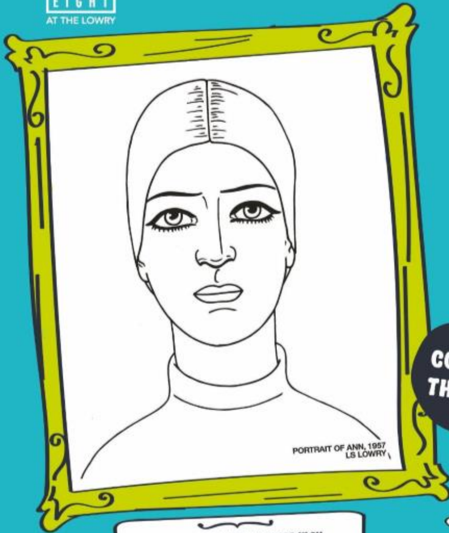
PORTRAIT OF ANN, 1957 LS LOWRY