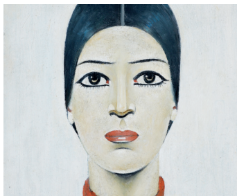
Portrait of Ann, 1957