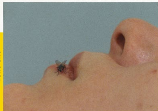
YOKO ONO, 1970, DIRECTED BY YOKO ONO © YOKO ONO

An eclectic and provocative exhibition of film, photography, painting and sculpture by artists who have embraced elements of chance in their work.