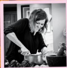
CERYS MATTHEWS - WHERE THE WILD COOKS GO THU 5 SEPTEMBER