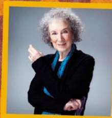
IN CONVERSATION WITH MARGARET ATWOOD SUN 27 OCTOBER