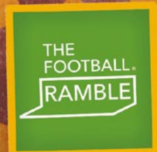
THE FOOTBALL RAMBLE SAT 2 NOVEMBER