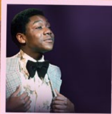
AN EVENING WITH LENNY HENRY WHO AM I, AGAIN? MON 4 NOVEMBER