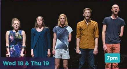
Wed 18 & Thu 19 CANDOCO DANCE COMPANY LET'S TALK ABOUT DIS/FACE IN