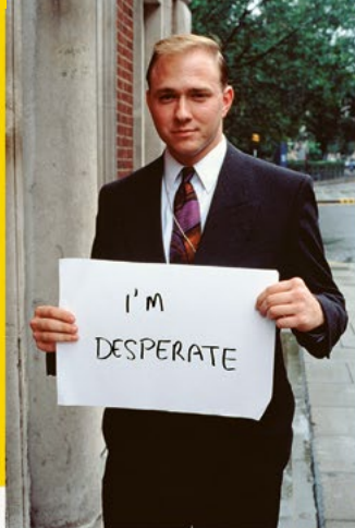
GILLIAN WEARING SIGNS THAT SAY WHAT YOU WANT THEM TO SAY AND NOT SIGNS THAT SAY WHAT SOMEONE ELSE WANTS YOU TO SAY I'M DESPERATE. 4.5 X 28.7 CM C-TYPE PRINT ON ALUMINIUM © GILLIAN WEARING, COURTESY MAUREEN PALEY, LONDON