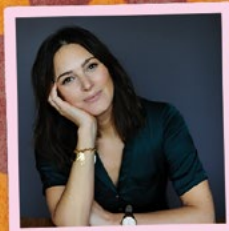
ELIZABETH DAY HOW TO FAIL LIVE WED 23 OCTOBER