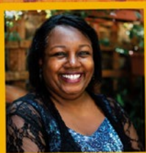
MALORIE BLACKMAN SAT 31 AUGUST