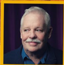
AN EVENING WITH ARMISTEAD MAUPIN TUE 8 OCTOBER